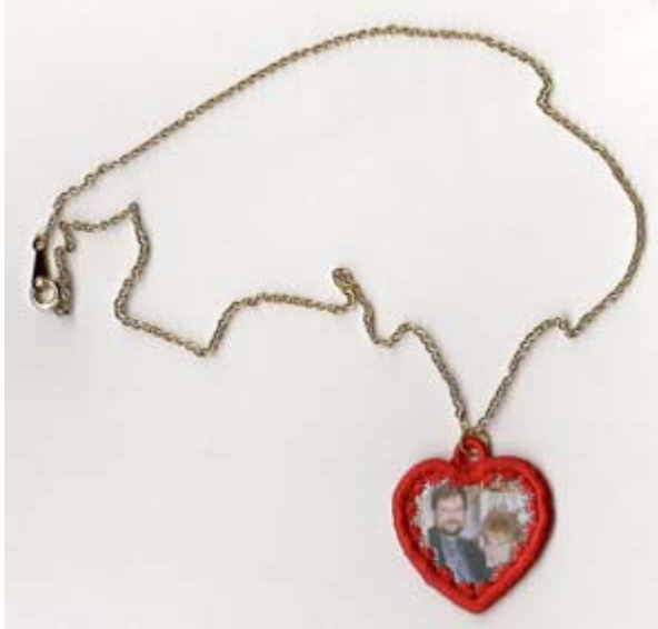
Frame with picture made into necklace