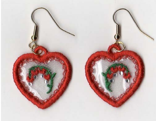
Earrings with crystals