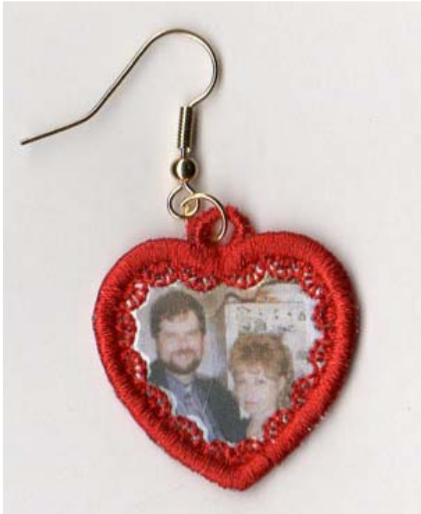
Earring with picture