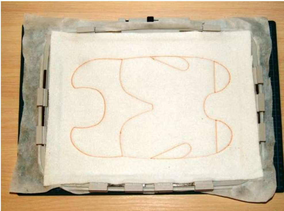
4 put the fabric on the contour of the parts