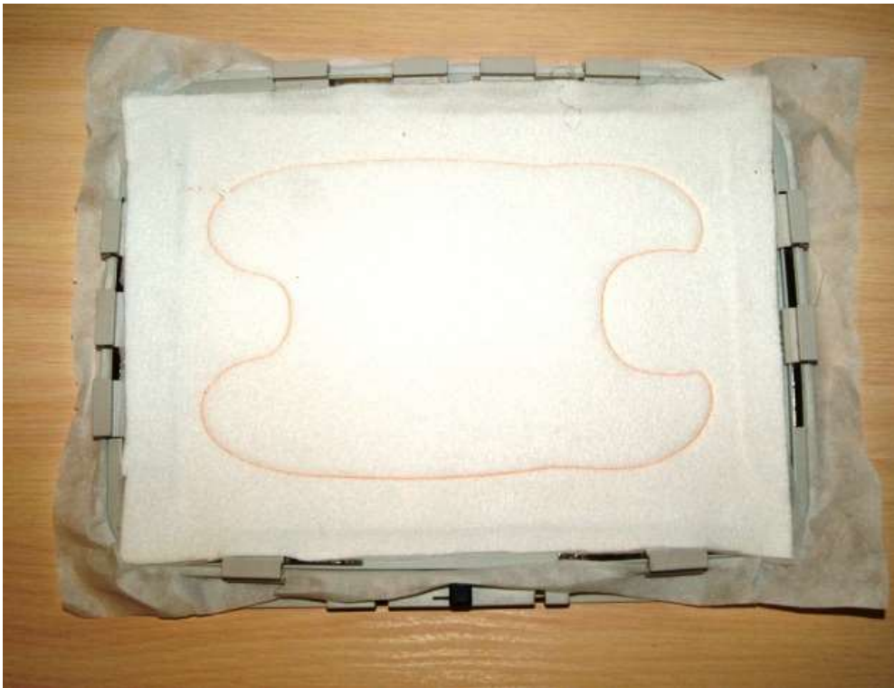
3 contour embroidery