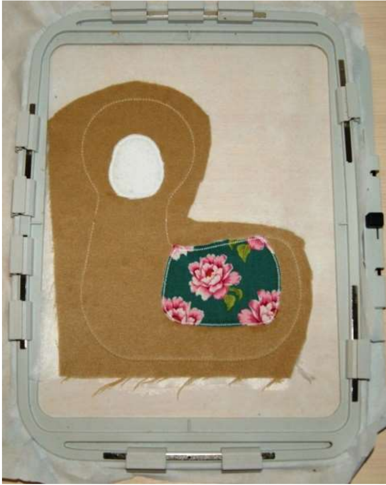
14. Sequentially embroidery the finishing contours of parts.