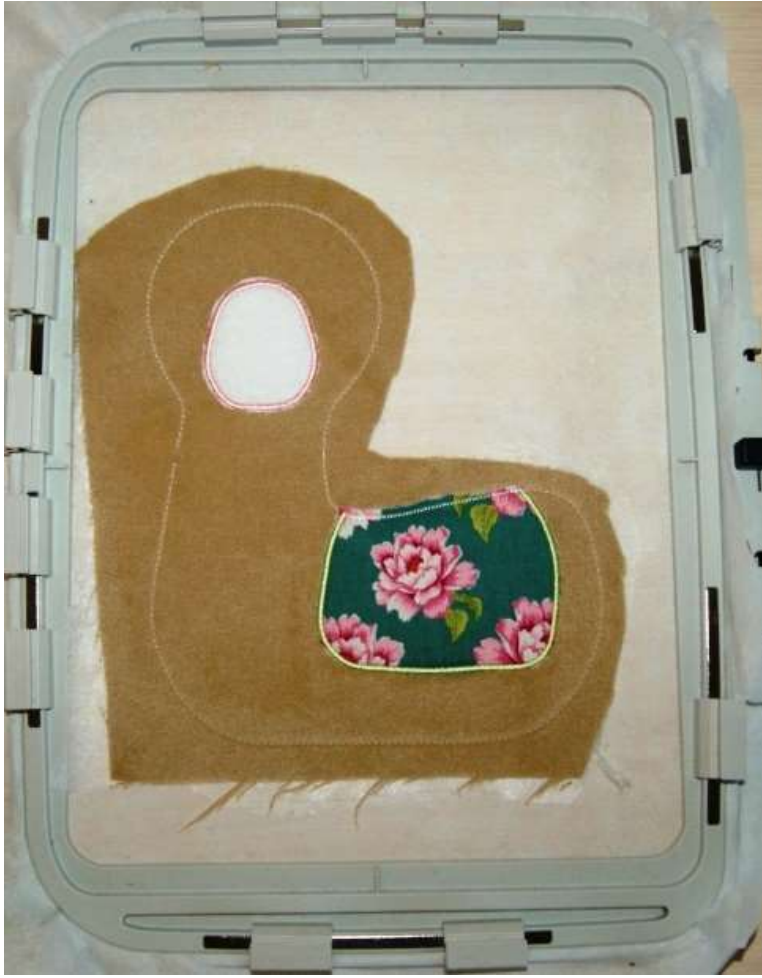
15. Embroider eyes and spout.