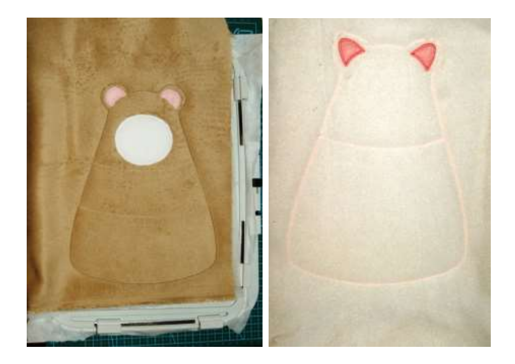
16-17. Put the fabric and lay the zigzag stitching line.