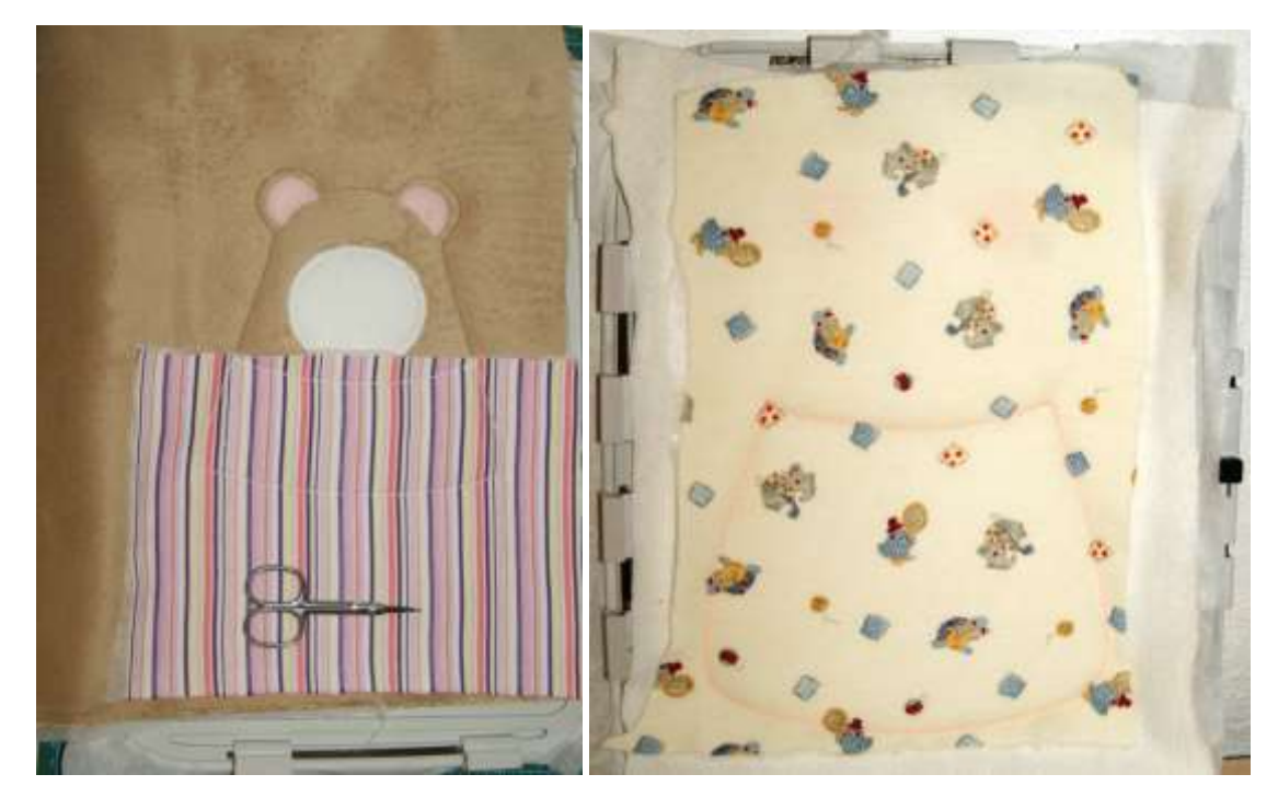
18. Remove excess fabric only at the top and bottom, do not remove the fabric from the sides.