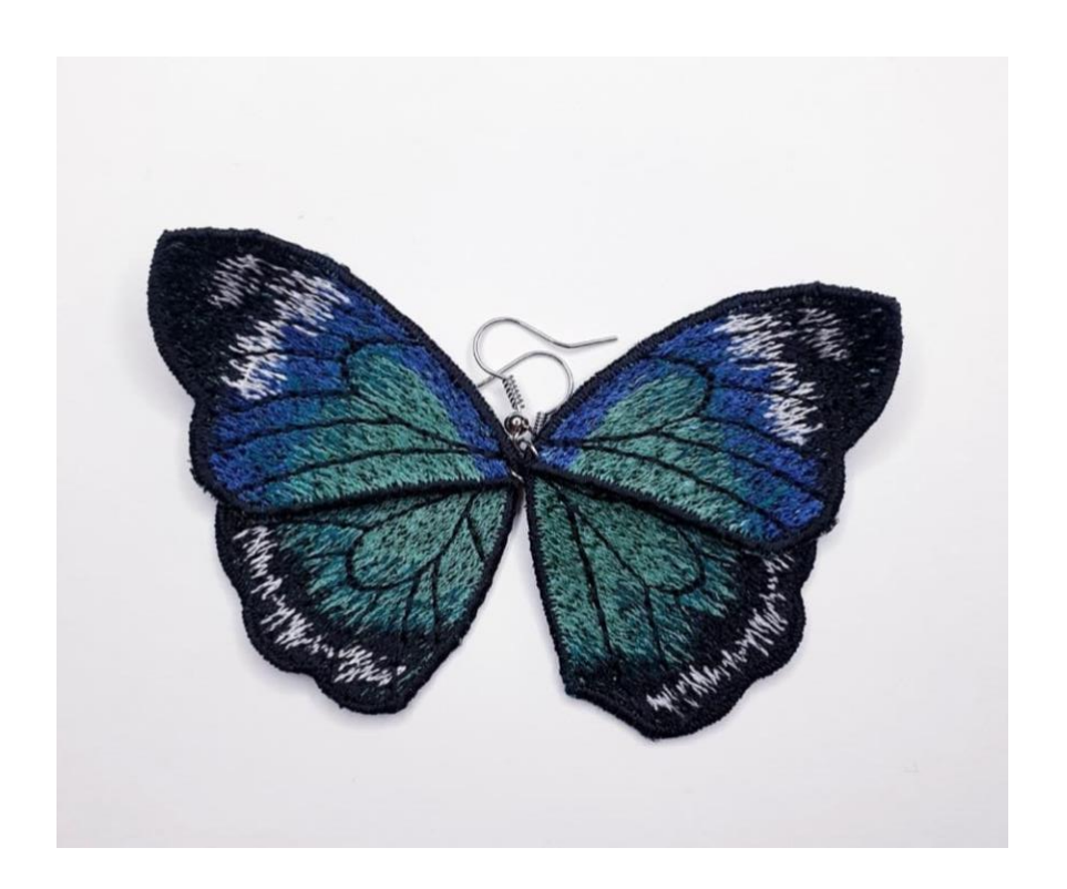
Enjoy this chic decoration!