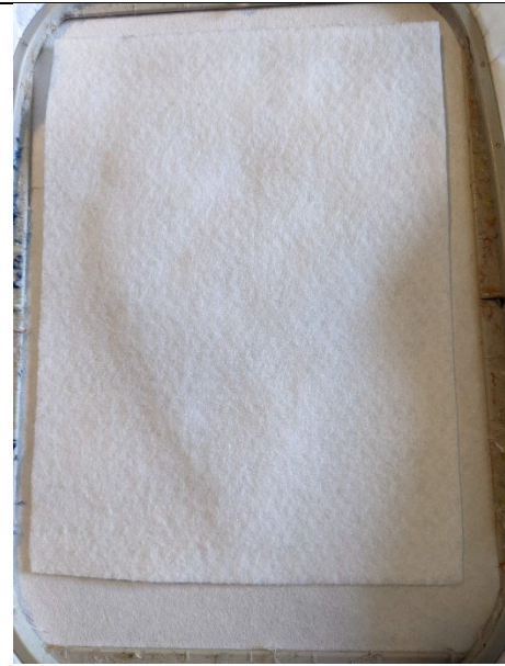
Put your basic white felt