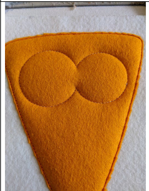
The next seam shows you the location for your felt