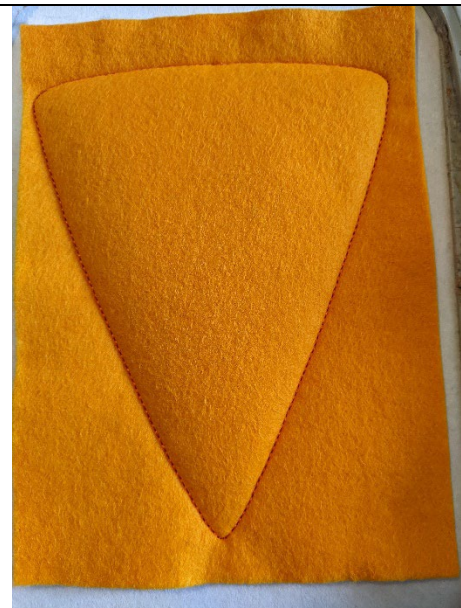
This seam will hold your colored felt on your white felt