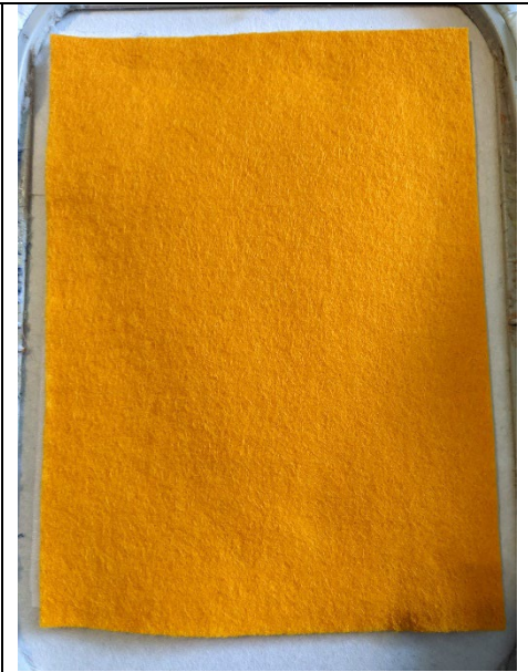
Put your colored felt