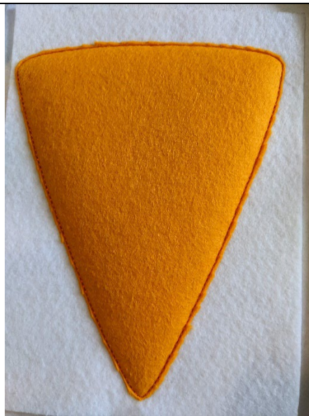
Cut off the excess of your colored felt