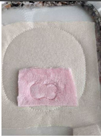
Stop #5: Seam of the teat tissue on your face