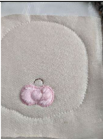
Stop #7: Seam for indicate you the location of the centre de la tétine