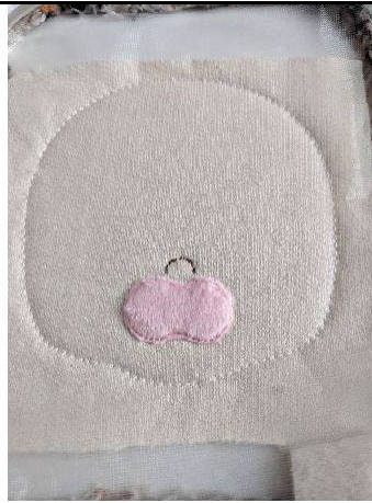
Cut the excess of fabric all around