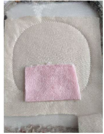
Put your fabric on this seam, the place from the fabric to you