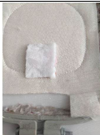
Put your fabric on this seam, the place from the fabric to you