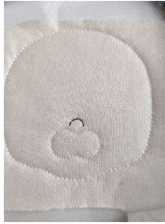
Stop #4: Seam for indicate you the location of the tétine