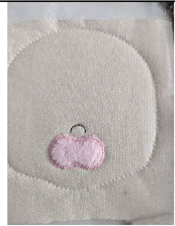
Judgment No 6: points of bumblebee all around the la tétine