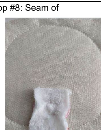
Stop #8: Seam of the inside of the teat