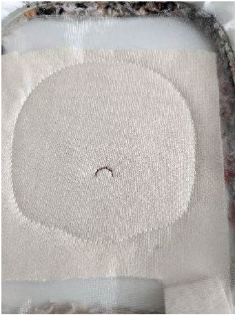
Judgment No 3: points of embroidery for your nose