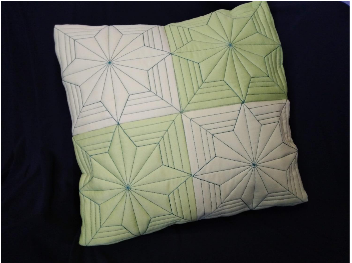
Also in my store