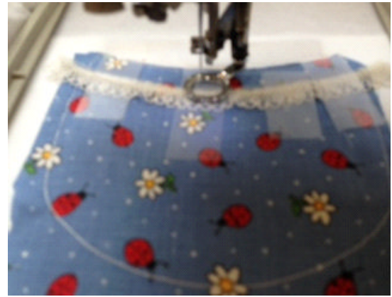
Continue for the rest of the designs in sets