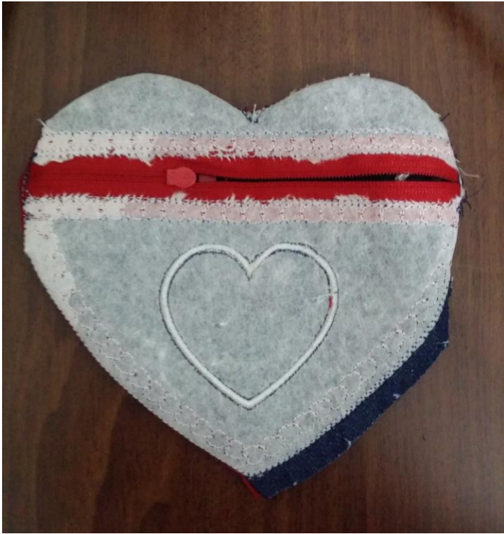
ITH Zippered Heart Bag with Pockets