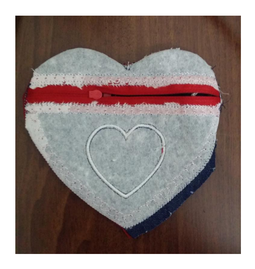
ITH Zippered Heart Bag with Pockets