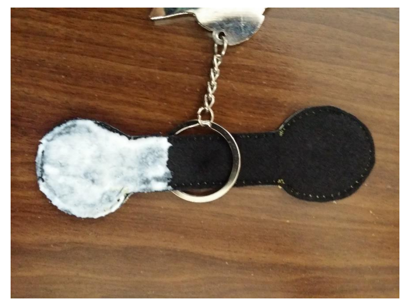
Stick the 2 halves together, let it dry and you can still trim a bit if any cutting is uneven.

NOTE: Another option is to sew together the 2 sides on a sewing machine, making sure the stitches blends in.