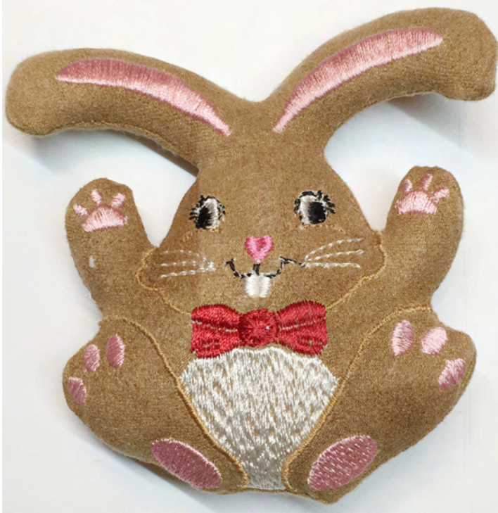
Figure 10. Stuffed bunny.

Continue using small amounts of stuffing to fill the rest of the bunny. Your animal should be soft and squishy. Do not overstuff. Overstuffed animals can become damaged if the seams are stressed.