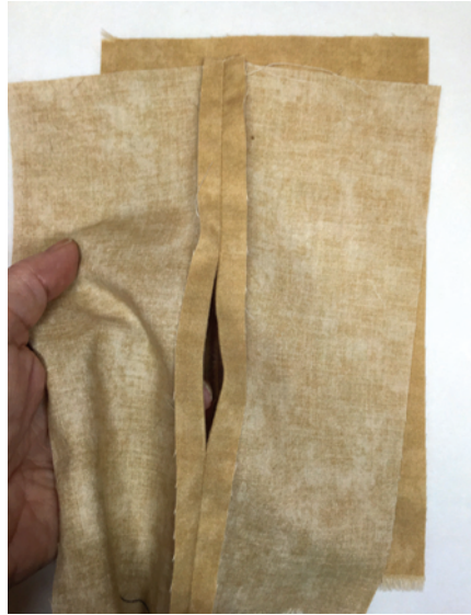
Figure 2. Pieced back with opening for turning.

With right sides together, sew 1/2" seam down one long side leaving the opening near the middle. Press seams open.