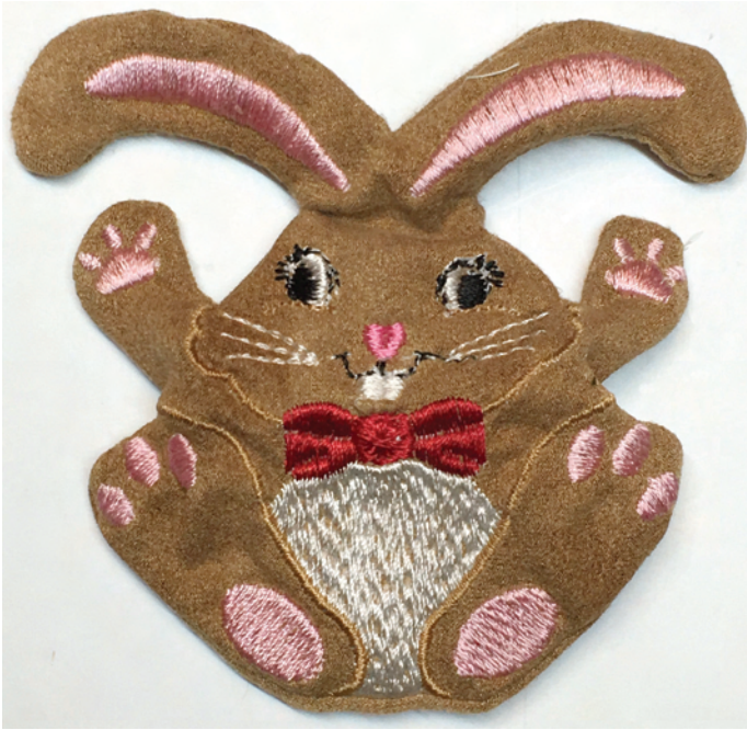
Figure 8. Turned baby bunny before stuffing.