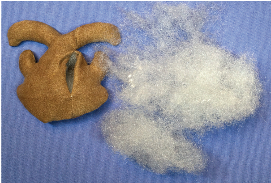
Figure 9. Stuff bunny with fiber fill.

You may need to use something (an unsharpened pencil, wooden spoon handle, non-working end of a knitting needle, or hemostat) to help you get the stuffing all the way to the end.