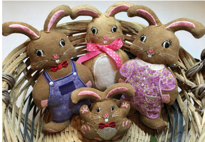
Add a cute bunny to this year's Easter basket.

Smooth quilt-weight or light to medium-weight cotton or cotton/poly blends. Knit fabrics also work well. Due to the small size and intricate outlines, thick, textured or loosely woven fabrics are not recommended.