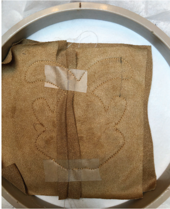
Figure 4. Back fabric is place face down over the bunny with seams taped down.