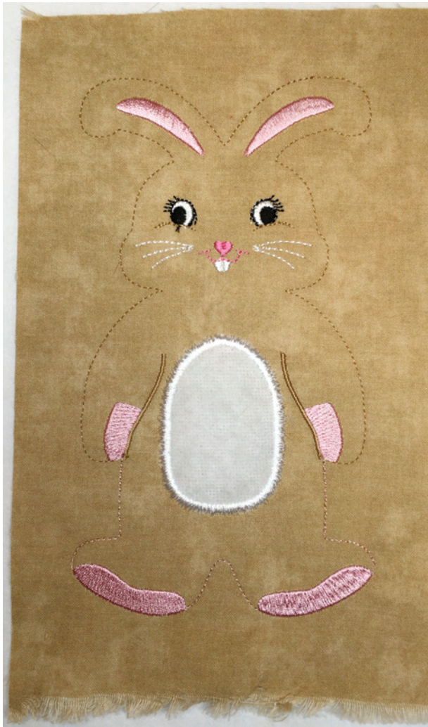
Figure 3. Embroidered bunny front, ready to place the back fabric.