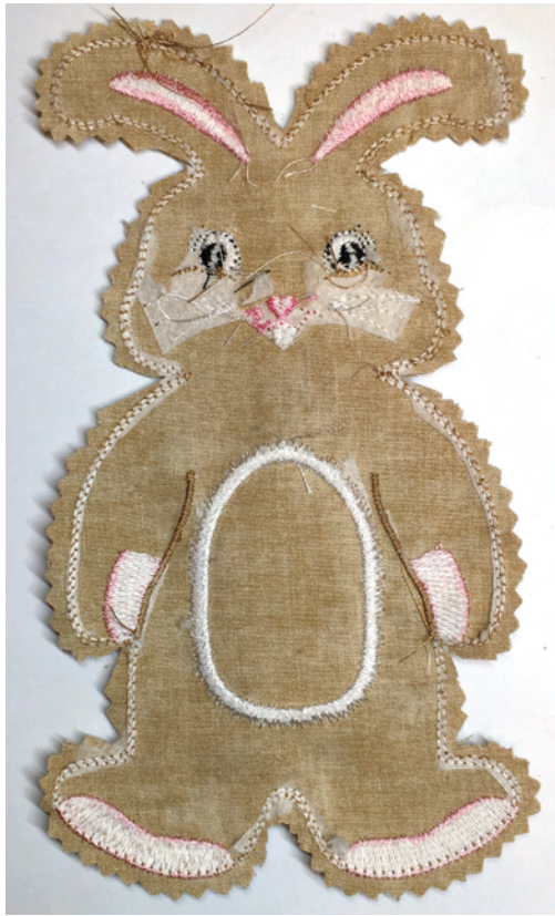
Figure 6. Trimmed bunny.