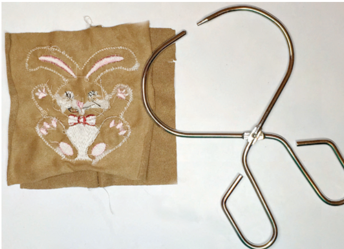
Figure 5. Remove stabilizer.