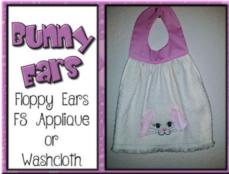
Cute floppy Bunny ears designed by DesignsByRhonda